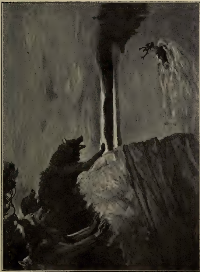
When Baree joined the pack, a maddened, mouth-frothing, snarling horde, Napamoos, the young caribou bull, was well out in the river and swimming steadily for the opposite shore.